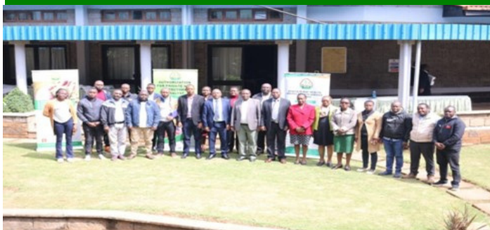
KEPHIS Team and the Private Inspector trainees at KEPHIS Head Quarters

Enforce compliance with national seed regulations and international protocols.