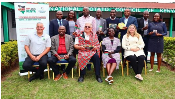
Group photo with President, adorned with welcome gifts, taken at the NPCK Headquarters during the launch of logistics for the 13th World Potato Congress (WPC 2026):