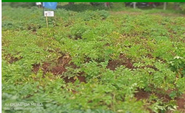
A photo of potato crop infested by late blight and early blight, in laikipia County taken during a farmer's field day.

Resistance develops when the same pesticide or mode of action is used repeatedly, allowing resistant individuals in the pest or pathogen population to survive and reproduce. In potatoes, common challenges include resistance in late blight ( Phytophthora infestans ) against fungicides, and insect pests like aphids and potato tuber moth developing resistance to insecticides. If unmanaged, resistance leads to increased production costs, crop losses, and environmental harm due to overuse of chemicals.