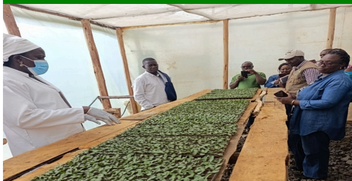
AGRA, NPCK and KALRO team members at one of the RAC private producer under KSPI project in Nyandarua county.

Rooted Apical Cuttings are produced from tissue culture-derived mother plants in screenhouses or greenhouses. Unlike traditional seed tubers, RACs are clonal cuttings, each genetically identical to the parent plant and free of viruses and other systemic pathogens. These cuttings are rooted in a sterile medium and can be transplanted directly into the field as seed starters.