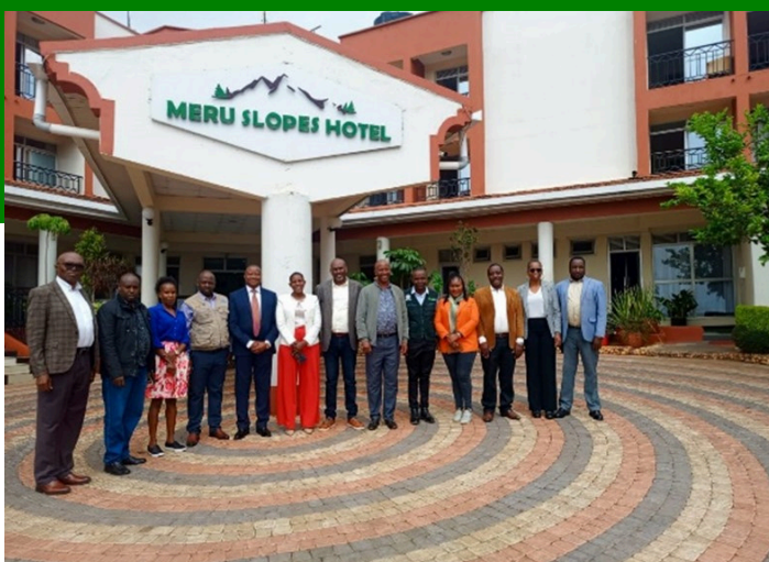
Stakeholders during the review meeting

To promote the adoption of the National Potato Strategy (NPS) and drive growth and expansion in the potato industry both at the county and national levels, all potato-producing counties need to develop their own County Potato Strategy (CPS). This will enhance coordination, with enforcement managed at the county level.