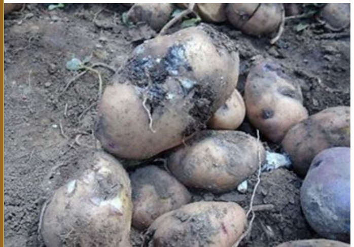
Potatoes affected by bacterial wilt

Click here to explore more on Controlling Bacterial Wilt in Kenya