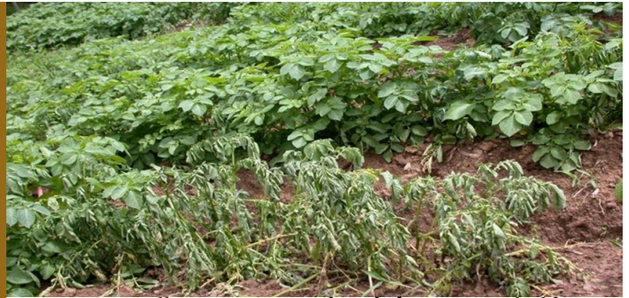
Potato crops affected by bacterial wilt

Kenyan potato belts are typically cool, high-elevation regions (e.g. Nakuru, Meru, Nyeri, Marakwet) with ample rain. Night time temperatures are low enough to favor potato tuber bulking – for example, Marakwet’s “very cold” climate is ideal for potatoes. However, R. solanacearum thrives in warm, moist soils and poorly drained fields. Infections rapidly spread during rainy seasons or irrigation if waterlogging occurs. The pathogen can survive deep in soil (even >1m depth) and on plant debris. Water-saturated soil and heavy run-off favor spread (bacteria wash into drains or onto adjacent fields). Thus, well-drained fields and avoidance of waterlogging are critical.