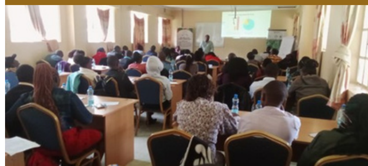
VBA training session in Meru County

On the Viasi Soko digital platform, VBAs are instrumental in promoting training farmers on the use of Viasi Soko for easy access to farm inputs and extension messages.