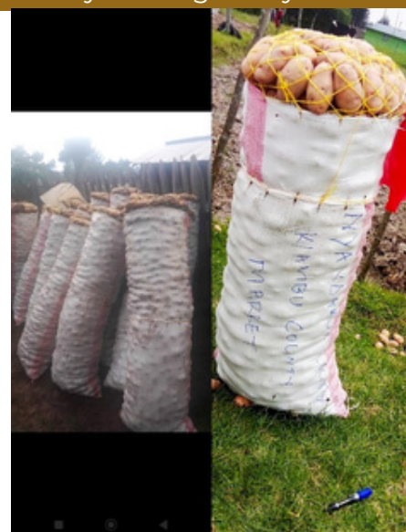
Some of the packaging methods for the different markets.

To enhance their impact, ware potato traders need to organize themselves into associations or cooperatives. This collective voice would enable them to lobby effectively for investments in essential infrastructure such as cold storage, grading sheds, and improved market spaces. It would also position them to advocate for better policies and stronger market linkages, ultimately expanding the market base for ware potatoes both locally and regionally.