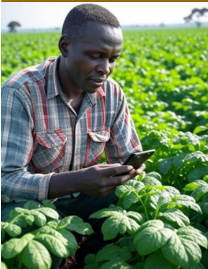
This is a farmer using a smartphone in the field to access real-time information, boosting productivity and efficiency in his farm.

In agriculture today, various innovations have emerged in the form of mobile apps, web-based platforms, and content-rich websites.