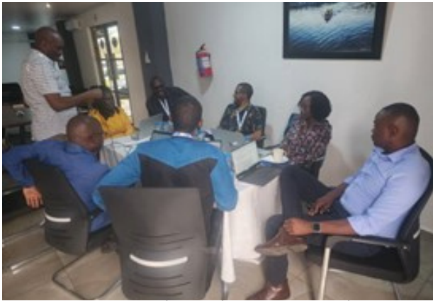
A group session during strategy review

Read More about the CEHA Regional Strategic Plan