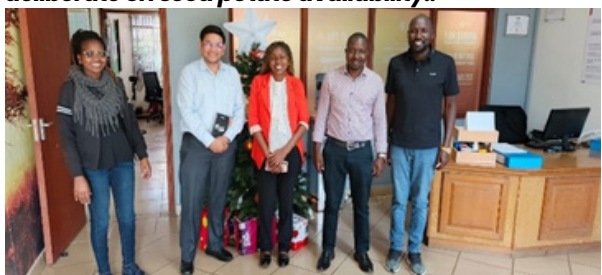
NPCK visit at Norda Industries