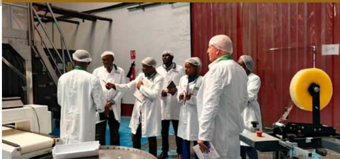
NPCK visit at Simplifine