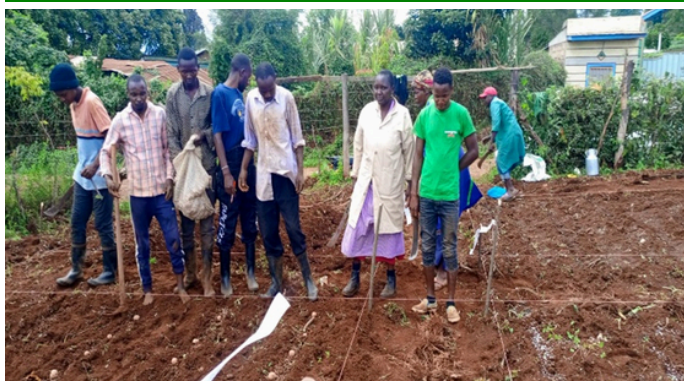
Farmers' training on-going as they actively participate in planting of potato demo at Kithaku in Meru county

Short rains farm demonstrations are ongoing in four project counties namely; Nandi, Meru, Nyandarua, and Laikipia) under the Kenya Sustainable Potato Initiative (KSPI) project. Three demo sites were identified in each of the four counties and one non-project demo site in Nakuru county. These sites were identified following the criteria in the questionnaire where the farmer has to be in a farmers' group, the land should not have been planted with crops in the Solanacearum family for the last 4-7 seasons, should be accessible and should have water for irrigation.