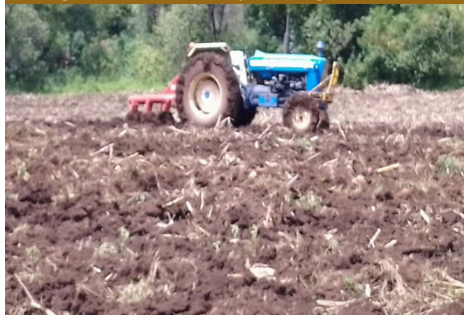
Land preparation in Lessos in Nandi county

Land preparation is key for increase crop productivity. It helps create the best conditions for plants to grow and establish themselves. The pieces of land identified for the demos in different counties were ploughed and harrowed using tractors before planting.