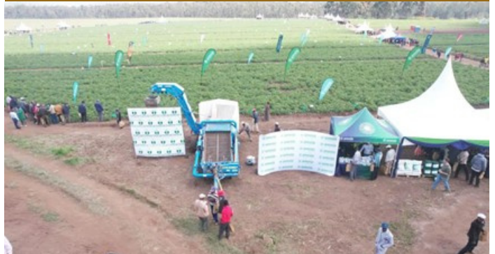
Farmers watch a live demonstration of potato harvesting machinery on a field day.

The use of nationally certified seed currently covers less than five percent of the acreage — a key impediment to growth in the sector. The International Potato Center (CIP) estimates that bacterial wilt spreading through poor seed yield can result in 30 percent losses. In addition, climate change — erratic rains and degenerated soil in the key potato-growing agroecological zones — leads to significant fluctuations in access to ware potatoes.