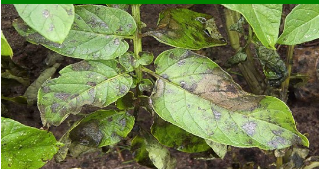
Symptoms of Late blight on a potato plant

Potato is vulnerable to several pathogenic organisms all which can cause severe quality and yield losses. As a consequence, potato production is highly reliant on agrochemicals to manage the disease which has a negative effect on the sustainability of the crop. One of the major diseases that is affecting potatoes is late blight. The symptoms of late blight include dark lesions on leaves and stems with white mold on undersides of the leaves. The solution is to plant blight resistance potato varieties such as Unica and Sherekea, practicing crop rotation and removing infected plant and debris. Farmers also are advised to apply preventive fungicides such as Equation Pro by Corteva and Infinito by Bayer. Another disease affecting potato production is Early blight. It causes yellowing of leaves and concentric on dark lesions. The solution for early blight are similar to late blight.