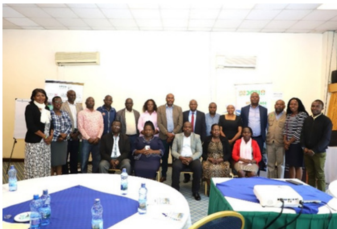
A section of CECMs during the first stakeholder engagements meeting at merica Hotel, Nakuru

Since the gazettelement in 2019, the regulation implementation and enforcement has not been so strong due to disjointed efforts thus inhibiting realization of the industry maximum potential. One of the best implementation mechanism is through ensuring a well-coordinated effort between the potato producing and marketing counties. Multi-stakeholder engagement meetings were conducted on 22nd October and 10th December 2024 bringing on board CECM and County Directors Trade and Marketing from both marketing and producing counties respectively.