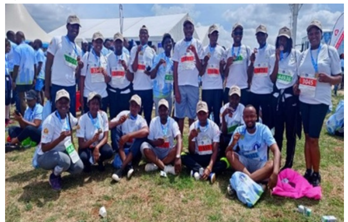
Potato team after the race in Uhuru gardens

Read More about the Standard Chartered Marathon