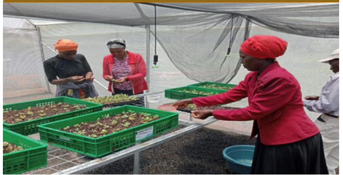
Some members of Baraka women group in their Greenhouse

To promote seed potato multiplication, NPCK together with KPSI partners, visited the Baraka Women Group members in Ngenia sub-location, Mukogodo East Ward, Laikipia North on October 1, 2024 to train on ARC. The group is committed to produce seed and ware potato.