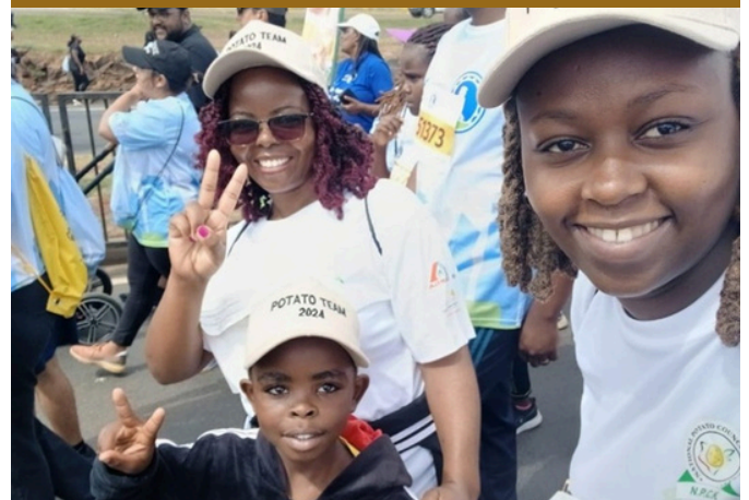
Some of potato team members enjoying the 5km family Run

For yet another year, the Potato Team constituted the International Potato Center (CIP), Sereni Fries, Agrico Potato Services Limited, Viazi Kings Limited, Kirinyaga Seeds Limited, Nichosville Dyslexia Shamba Village Farm, NPCK, Potato Framers and friends of Potato participated at the Annual Standard Chartered Marathon 2024. The team has built a reputation as the one to bring energy and passion and create awareness of the 2nd most important food crop in Kenya through the race every year. Potato Team's runners showcased incredible resilience, crossing the finish line with smiles and cheers. This team members were groomed in signature potato-inspired gear which made the team stand out and increased visibility among others.