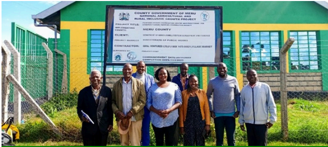
Ntirimiti Tumaini co-operative Officials, NPCK co-operatives officer and Viazi kings marketing officer after groups assessment meeting