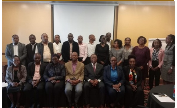
Stakeholders during the review of Standard Operating Procedures for Phytosanitary measures

Trade in potato among EAC (East Africa Community) member countries exists due to comparative advantages in some countries over others. For this to take place, commodities must transit across borders. However, the movement of potato poses a risk of introduction, establishment and spread of quarantine pests or regulated non-quarantine pests (RNQP). Therefore, phytosanitary measures have to be taken to mitigate such risks. These measures (non-tariff measures), should be instituted in a scientifically justified, transparent and non-discriminatory manner. For this reason, an agreed way of inspecting potato among the EAC Partner States has been conceived