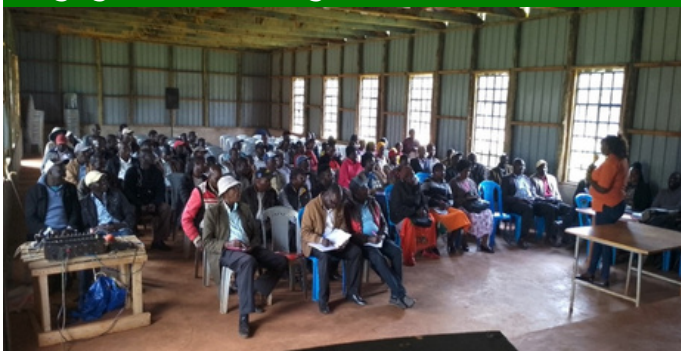
Ongoing Farmer Training Session on building cooperative structures

A farmer training session was held at Lelchego Cooperative Hall in Chesumei Sub-County, Nandi County, aimed at empowering local farmers to build cooperative structures. The training emphasized the importance of forming farmer groups, which would eventually integrate into a larger cooperative governing all potato farmers in the sub-county, with the ultimate goal of establishing a national potato cooperative. Farmers were guided through the gross margin of potato production, from seed acquisition to marketing and value addition, as well as the financial aspects critical to cooperative and group growth. Additionally, attendees were briefed on the Kenya Sustainable Potato Initiative project, including its regional activities, goals and objectives, fostering awareness and engagement among local farmers.