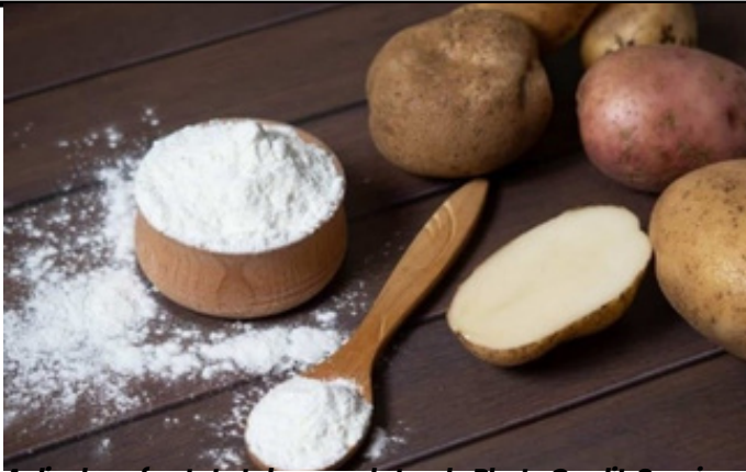
A display of potato tubers and starch.