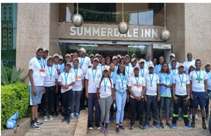
Potato team at Summerdale Inn