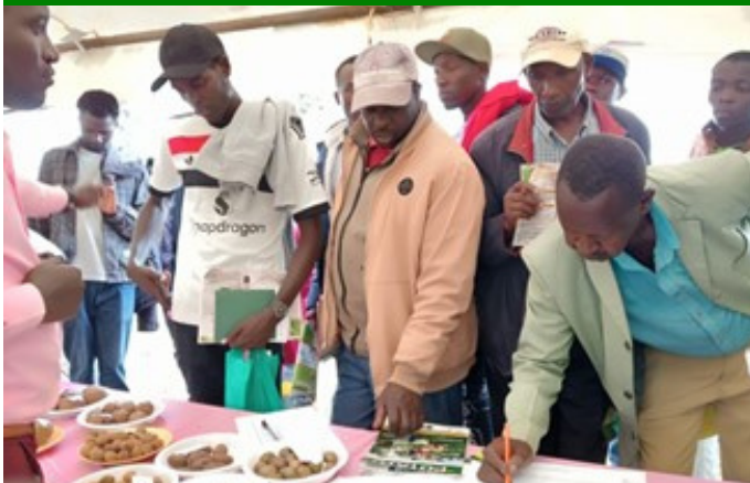
NPCK stand at World Food Day at Kaimosi, Nandi County

At the event, NPCK shared a booth with Egerton University and Viazi Kings Limited, both key partners in the AGRA-funded KSPI project aimed at promoting sustainability in the potato value chain. NPCK's booth drew strong interest from farmers eager to learn more about potato farming.